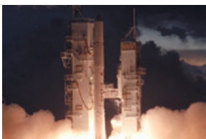
1986 Successful launch of first H-I rocket