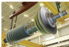
2011 World's most-efficient J-series gas turbine achieves record turbine inlet temperature of 1,600°C during demonstration test