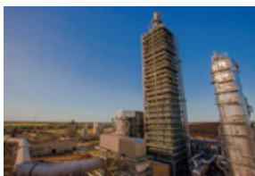
2016 World's largest CO 2 capture plant (for enhanced oil recovery) completed in the U.S.