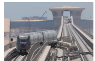
2019 Doha Metro, a fully automated unmanned urban rail system, begins operation in Qatar